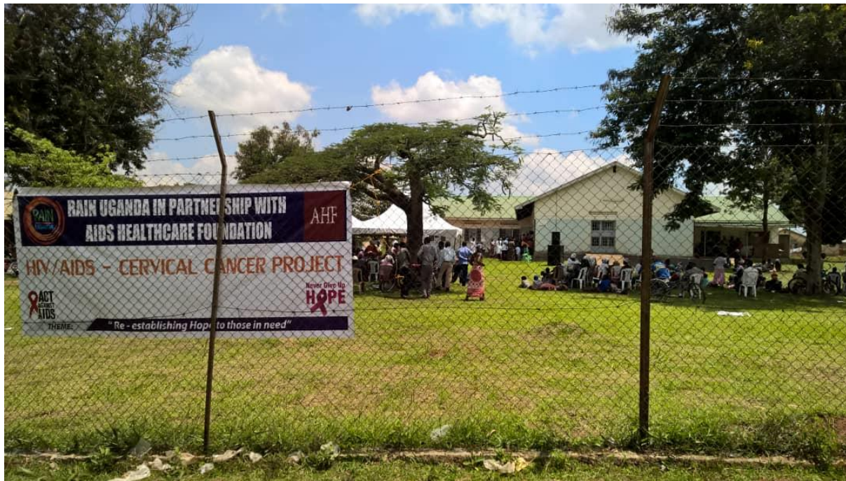
Budaka community outreach