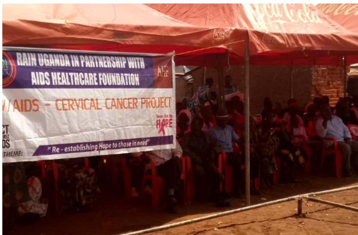
Clients waiting for screening in an outreach