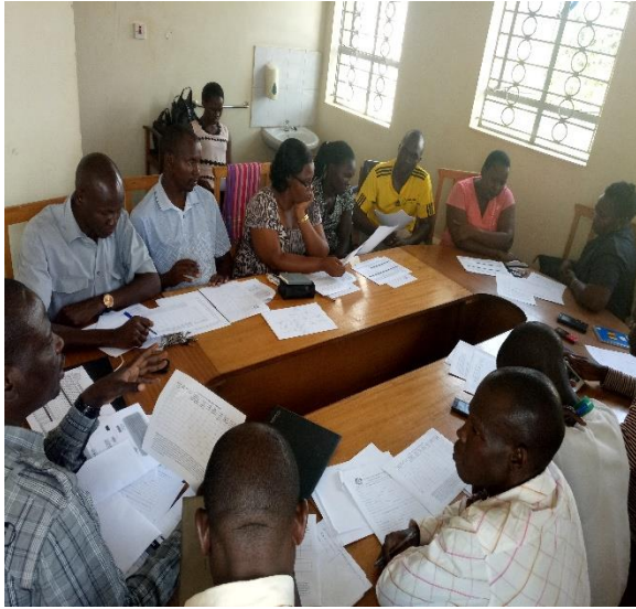
Staff orientation meeting.