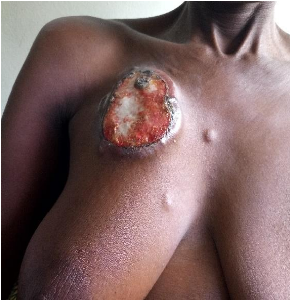
One of the women with suspected breast cancer