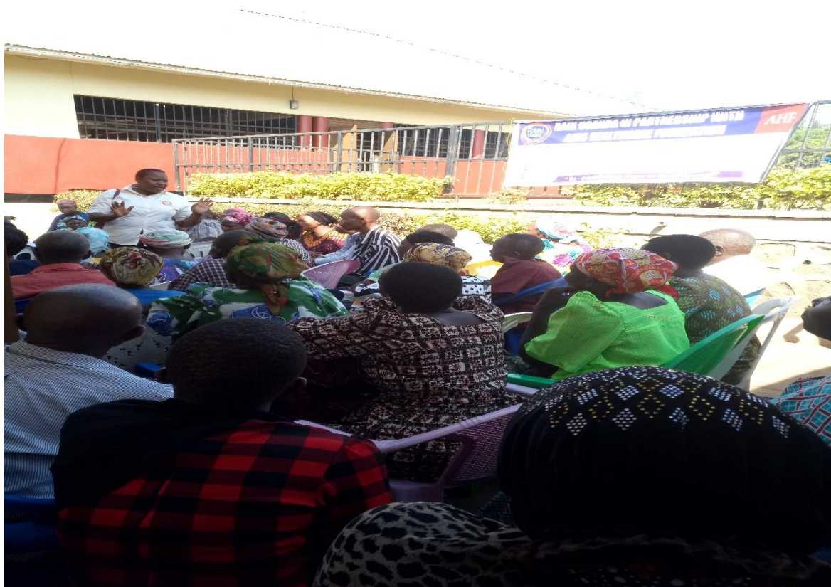
Buyobo, Sironko district outreach