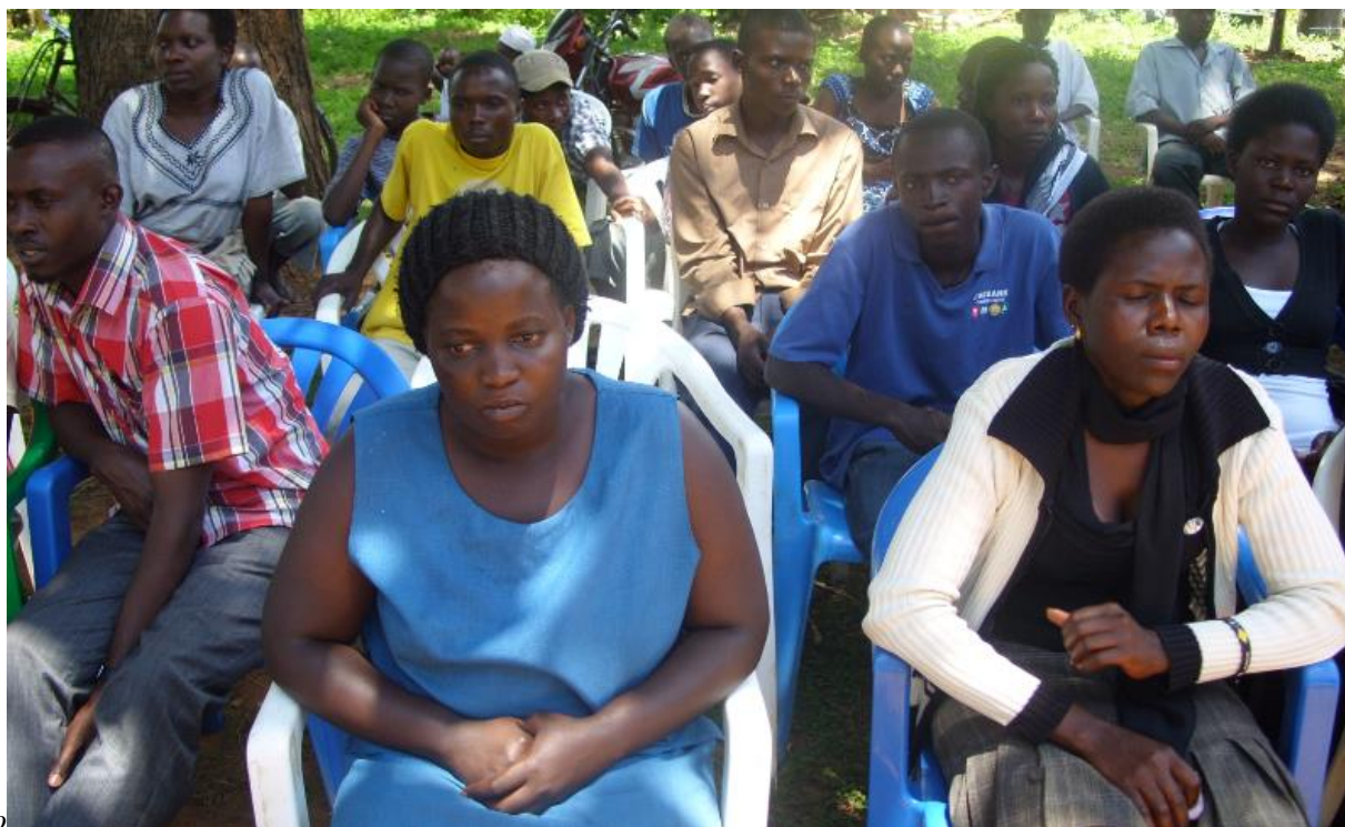
Engaging the youth on HIV and HPV issues