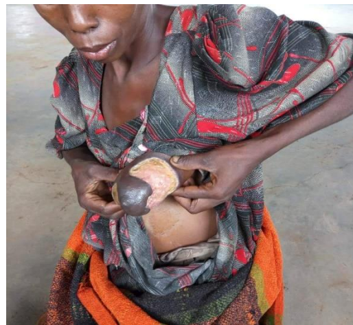
one of the women with suspected breast cancer