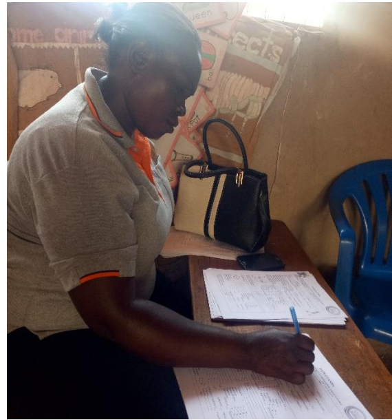
CaCx focal person at registration desk