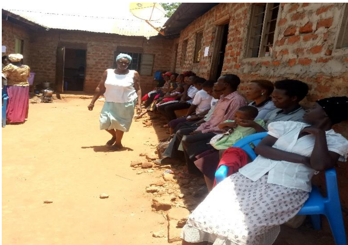
Clients waiting for testing and others waiting for their results in one of the outreaches.