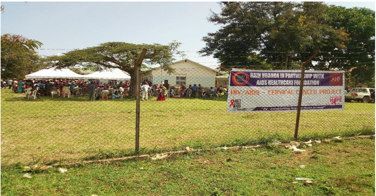
Budaka community outreach at Budaka Health center iv