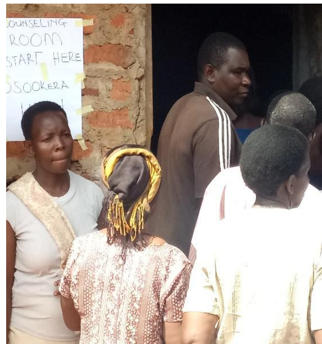
Linning up for screening services.