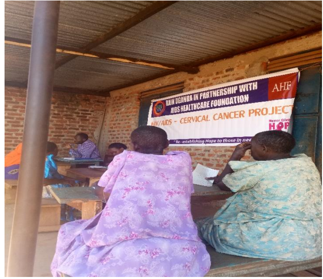
Registration before screening