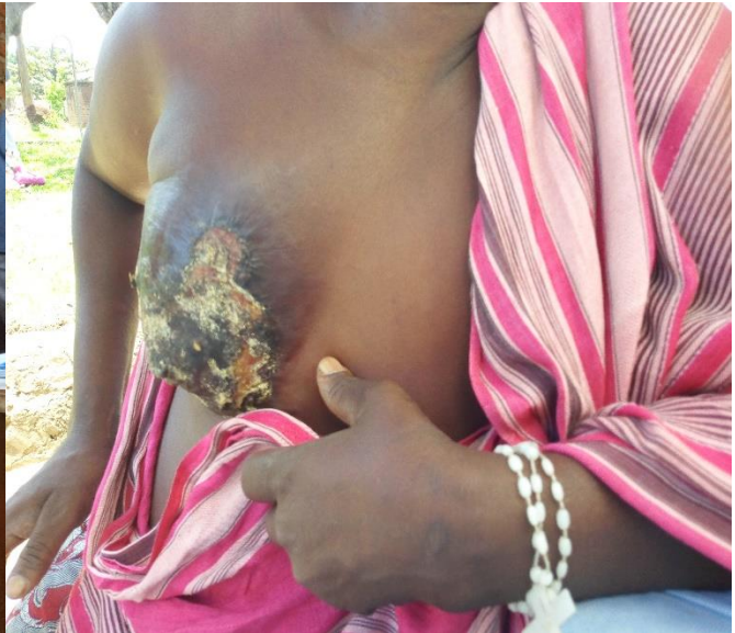
one of the women with suspected breast cancer