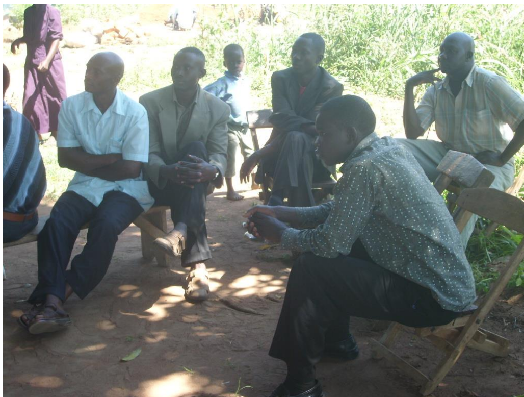
Forcus group discussion with men in one of the education sessions outreach