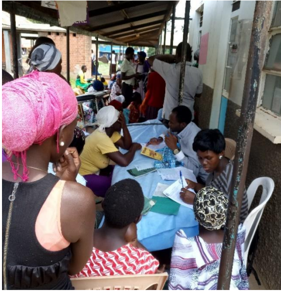
Registration for cervical cancer