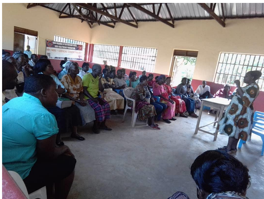
Education session in one of the womens' groups that invited us