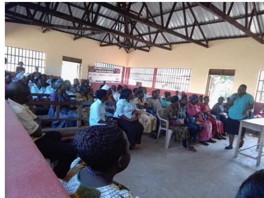
Health education sessions