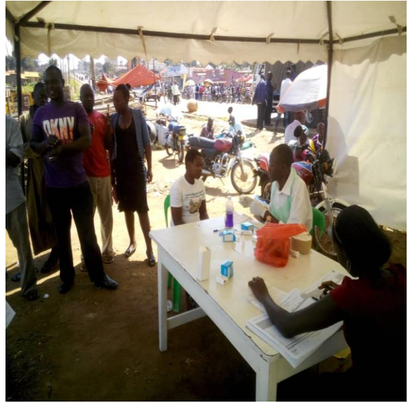
Registration before screening