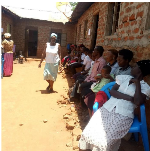
Waiting for the services