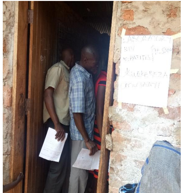
Improvised laboratories in the community