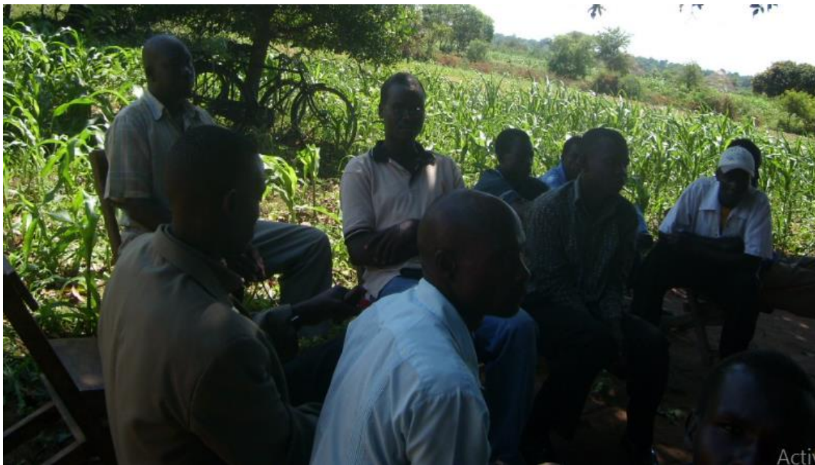
Engaging men of all ages, they are waiting to HIV counseling and testing.